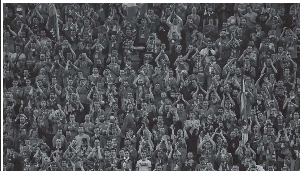
Zenit St. Petersburg has twice faced charges from European football's governing body UEFA as a result of racism from fans during matches in the Europa League